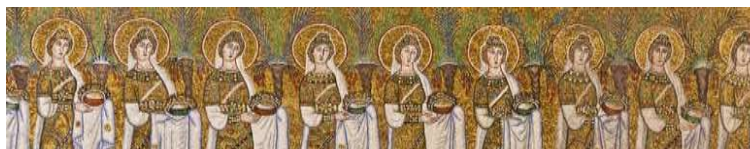
Women's Ministries Initiative: Series Study Days / Discussions

(sorry, brilliant as this is, you're only allowed to go if you really CANNOT get to AG York on 29th Sept)